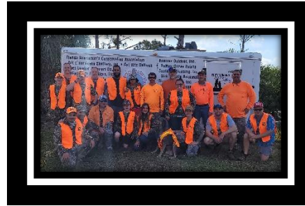
ABOVE PHOTO: INDIAN RIVER COUNTY AIRBOAT ASSOCIATION BUCK/DOE HUNT, 2021 AT GRASSY ISLAND RANCH