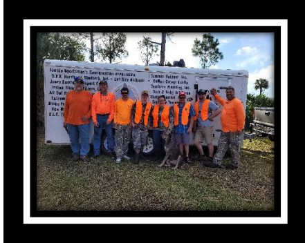
ABOVE PHOTO: CLUB VOLUNTEERS!!!!