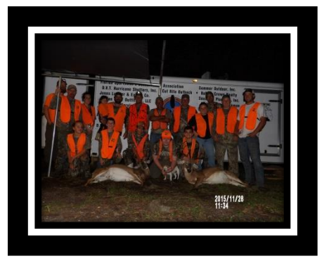
ABOVE PHOTO: INDIAN RIVER COUNTY AIRBOAT ASSOCIATION BUCK/DOE HUNT, 2015 AT GRASSY ISLAND RANCH