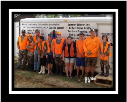
ABOVE PHOTO: YOUTH HUNTERS WITH THEIR GUIDES